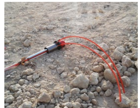
Sisgeo extensometer head ready for installation