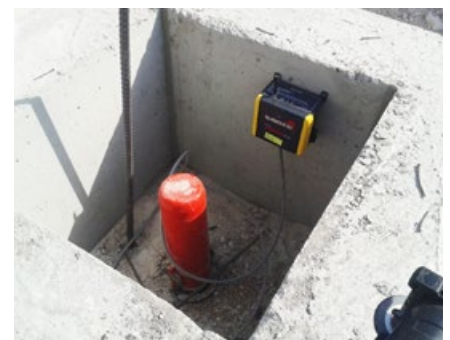
Sisgeo Mini-OMNIALog datalogger mounted to the side of the manhole